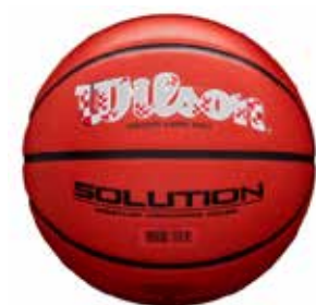
Wilson FIBA approved Game Ball 7 for Boys

Balls: During the championship the following FIBA approved Balls will be used: