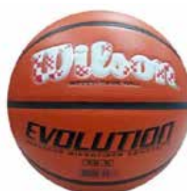
Wilson Game Ball 6 for Girls

For warm-ups prior to the games, 3 Balls will be given to each team