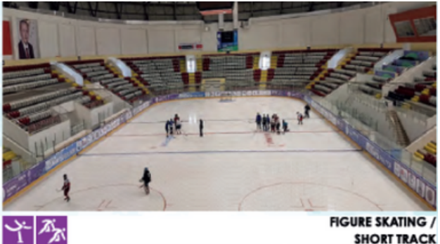
FIGURE SKATING / SHORT TRACK