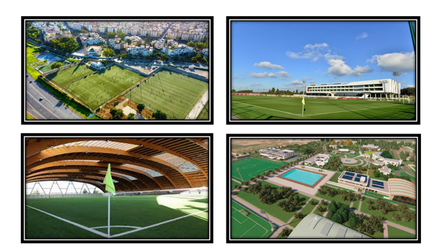
Motto is Proximity, Diversity and Quality.