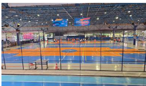
Ginasio do colégio Marista de Brasilia Ensino Medio - Maristão