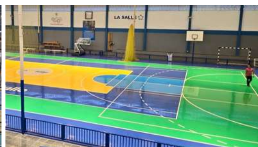
Ginasio do colégio La Salle de Brasília