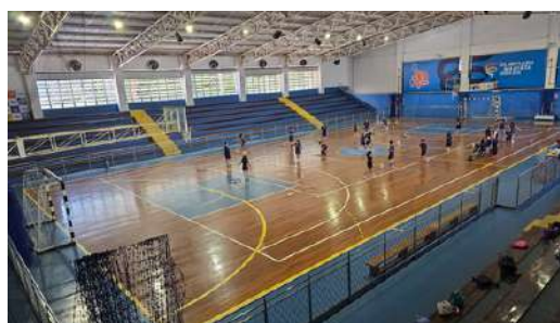
Ginasio do colégio Marista de Brasilia Ensino Medio - Maristinha

ASCAD – Associação dos Servidores da Câmara dos Deputados